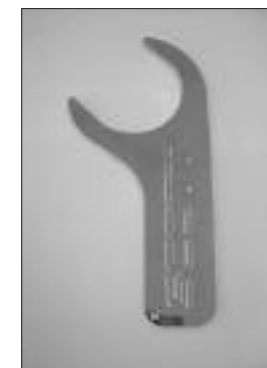
torque wrench with a 4mm Allen key