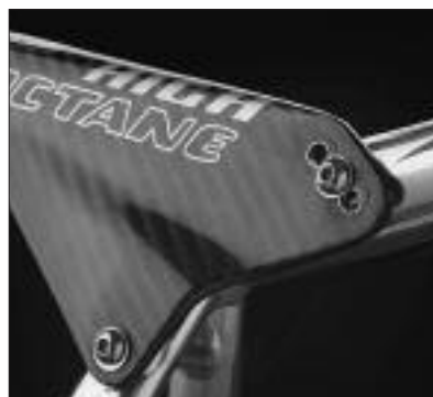
seat angle adjustment