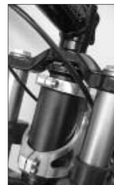
headtube High Octane DH