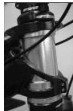
headtube High Octane FR