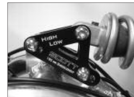
adjustment-plates for different lengths of suspension.