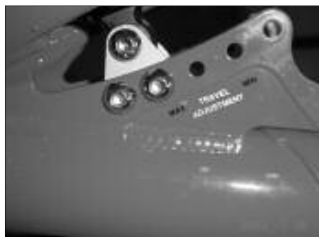
drillings on the shock mounts