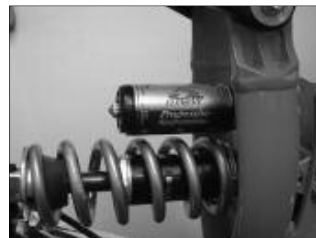
Rearshocks in position « front - top »