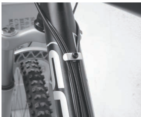
Smart Cable Routing