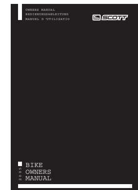
Genius Shock Manual