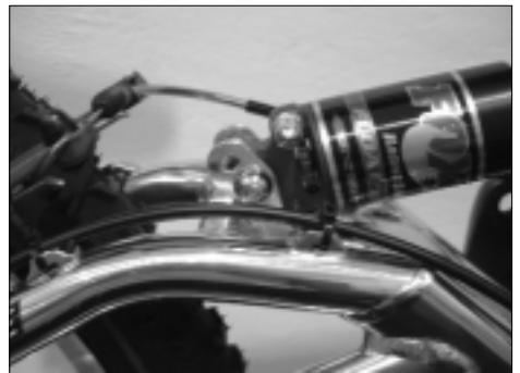
100mm, "normal" BB height, for Tour