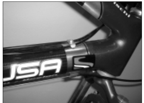
Smart Cable Routing