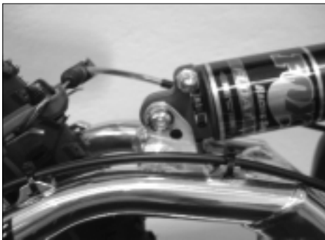
85mm, 10mm lowered BB, for XC

This position will be preferred in rough terrain.