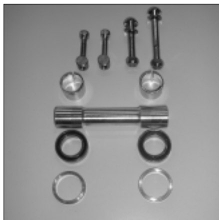
set of bearings

In case of a change of the bearings or of the rear swingarm you should contact your local SCOTT dealer therefore you need special tools for disassembly and assembly.