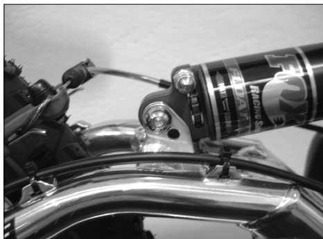
85mm, 10mm lowered BB, for XC