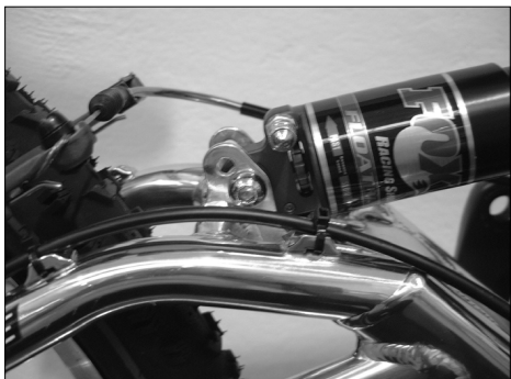
100mm, "normal" BB height, for Tour