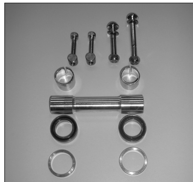
set of bearings