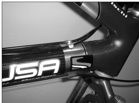
Smart Cable Routing