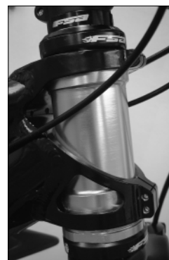
headtube High Octane FR