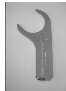
torque wrench with a 4mm Allen key