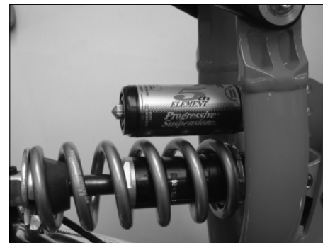
Rearshocks in position « front - top »

IMPORTANT ! Note that you have to mount Rearshocks always with the container (Piggy Pack), as shown underneath in the positions "front-top". Mounting the suspension in a different position can lead to severe damages at the frame, the rear and the suspension!