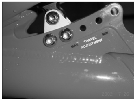
drillings on the shock mounts

IMPORTANT ! Note that you have to mount Rearshocks always with the container (Piggy Pack), as shown underneath in the positions "front-top". Mounting the suspension in a different position can lead to severe damages at the frame, the rear and the suspension!