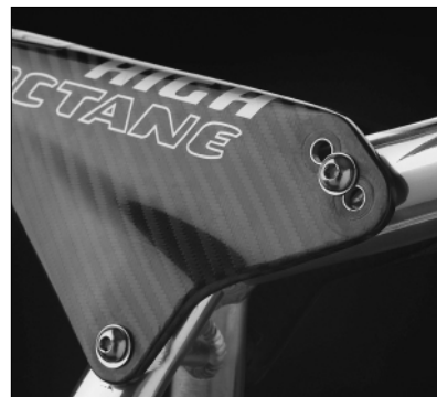
seat angle adjustment