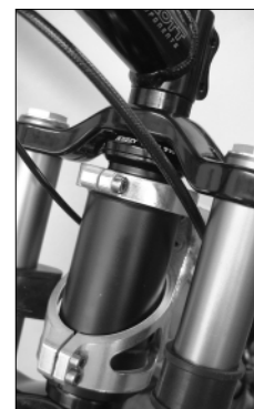
headtube High Octane DH