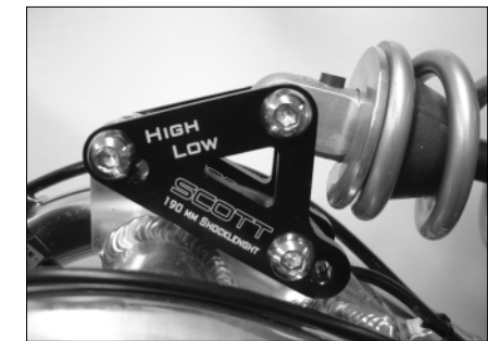
adjustment-plates for different lengths of suspension.